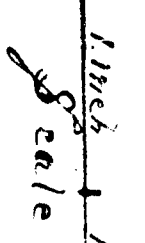
Section 18 Township No. 19 N. of Range 11 West Mich.